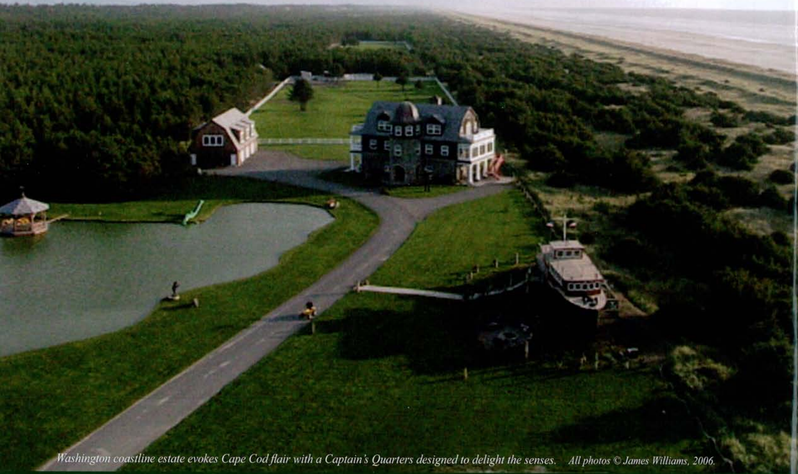
Washington coastline estate evokes Cape Cod flair with a Captain's Quarters designed to delight the senses.